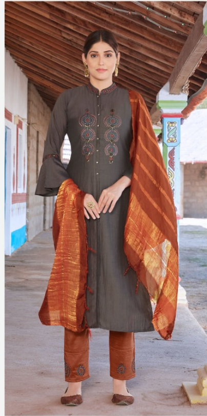
Be your own design and style icon with this dress. D No :- 2774