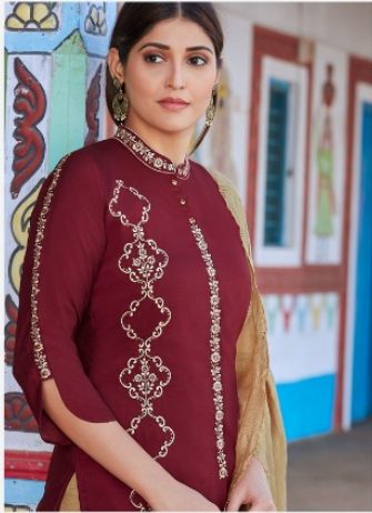
Be your own design and style icon with this dress. D No :- 2776