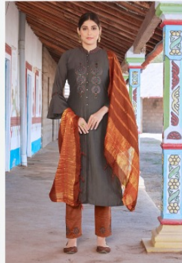
D No :- 2774