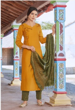
D No :- 2773