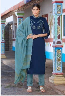
D No :- 2771