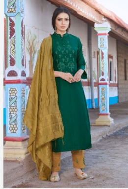
D No :- 2775