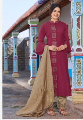
D No :- 2772