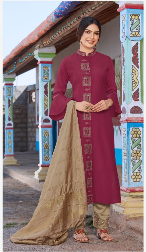
Be your own design and style icon with this dress. D No :- 2772