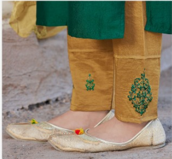
Be your own design and style icon with this dress. D No :- 2775