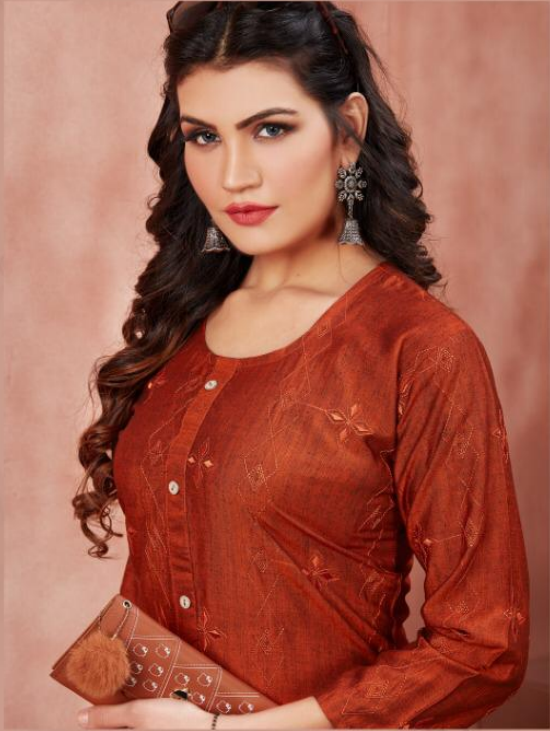
1001 She stands in a land known for its culture, its heritage, its beauty and its untold riches. And yet, with her beauty,