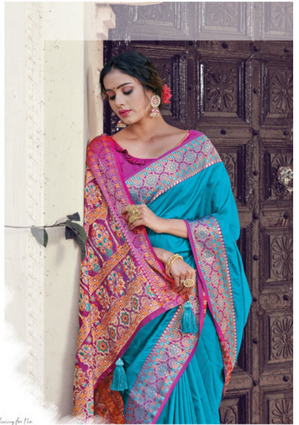
Introducing for the first time Modern as well as traditional ready to wear printed saree with border saree 1002