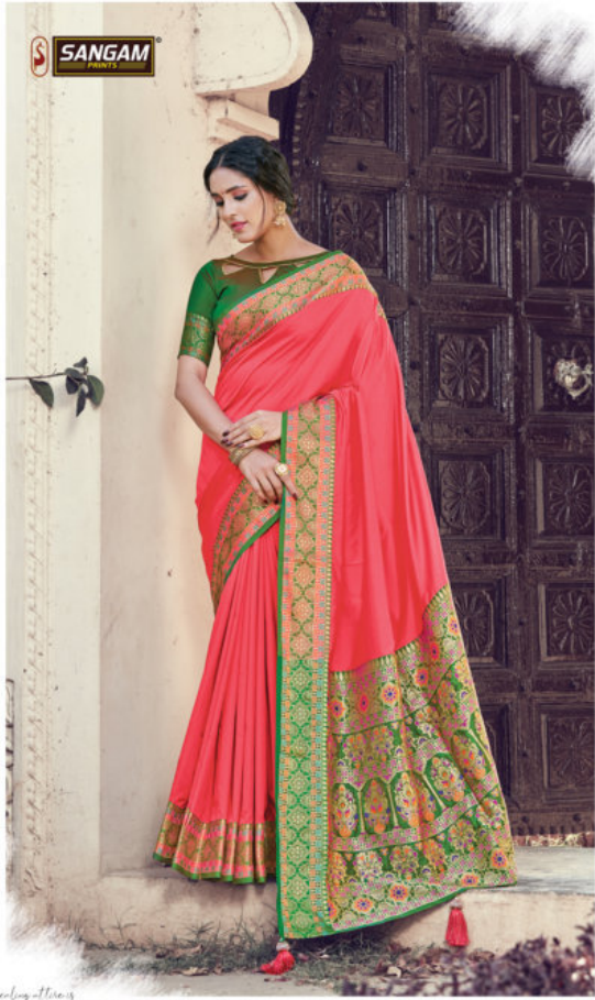
This appealing attire is a fairy tale that begins to spread out as you reveal your beauty in it 1001