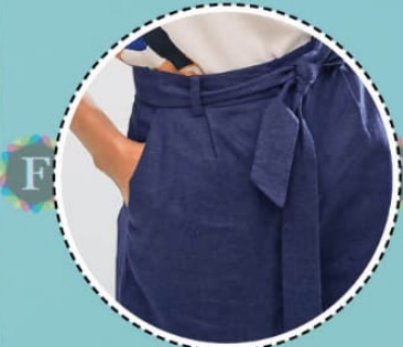
Full Length Belt for Perfect Knot