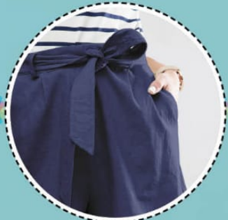
Both Side Pocket