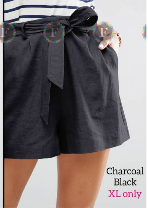
Charcoal Black XL only