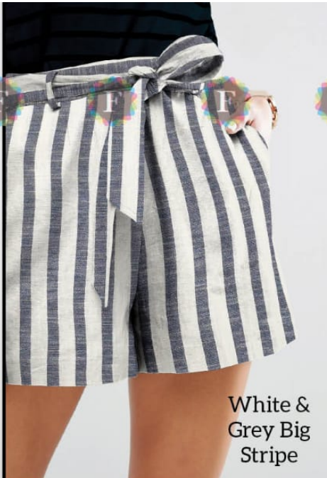
White & Grey Big Stripe