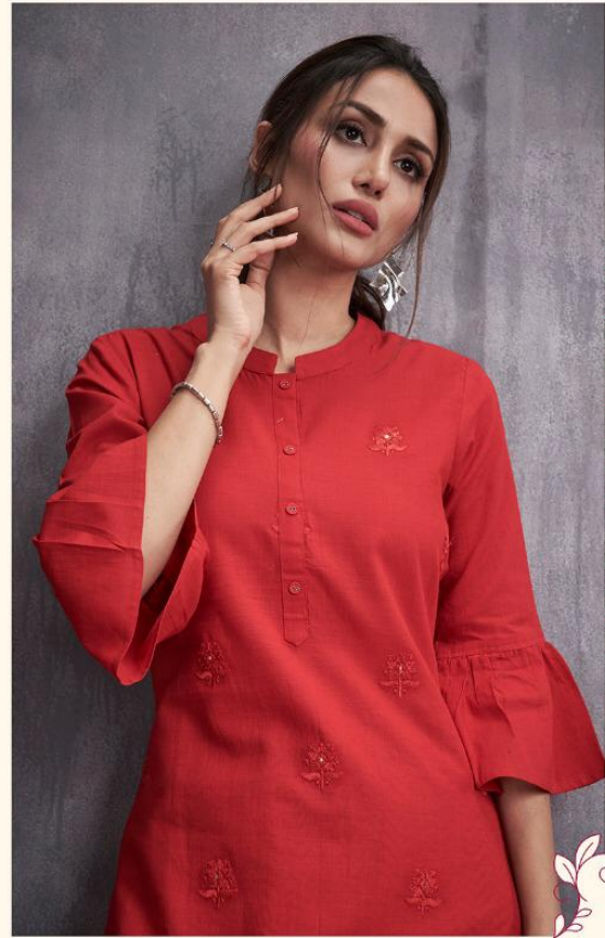
KURTA: COTTON SLUB WITH COMPUTER EMBROIDERY PALAZZO PANTS: COTTON LINA WITH ETHNIC BLOCK STATE PRINT