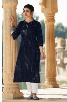
• 39034 •