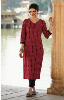
• 39033 •