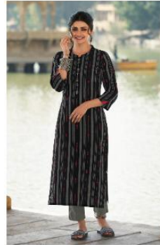
• 39037 •