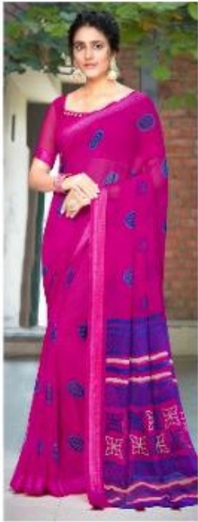
11345 - A