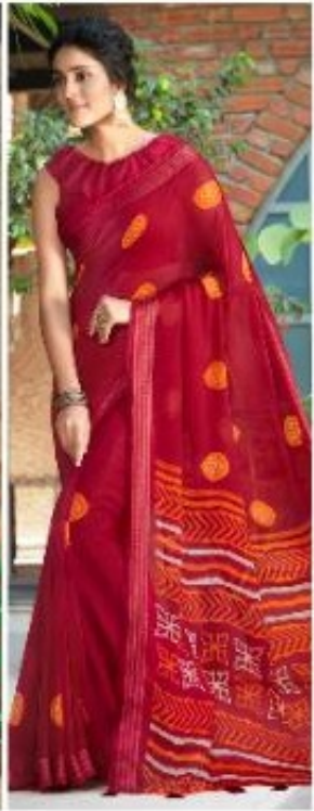
11345 - D