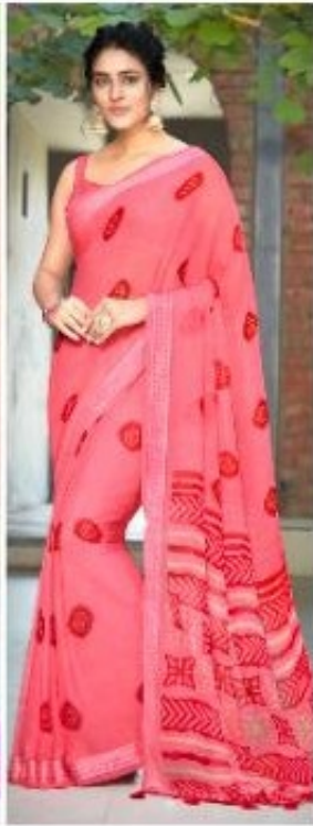
11345 - B