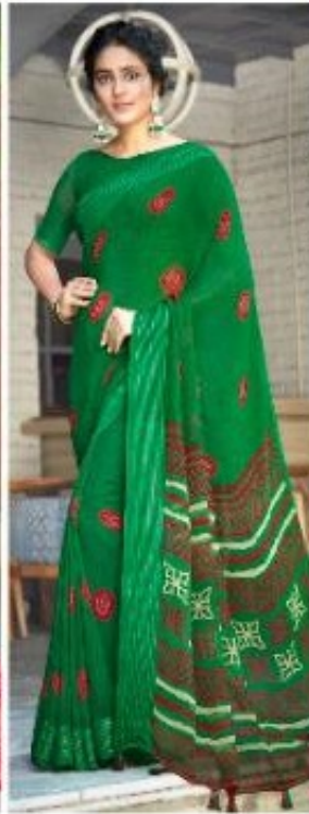
11345 - C