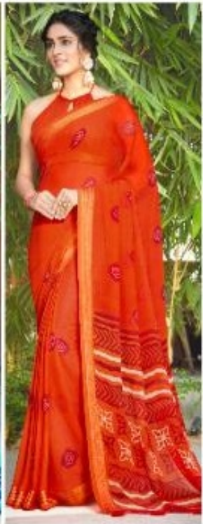
11345 - H