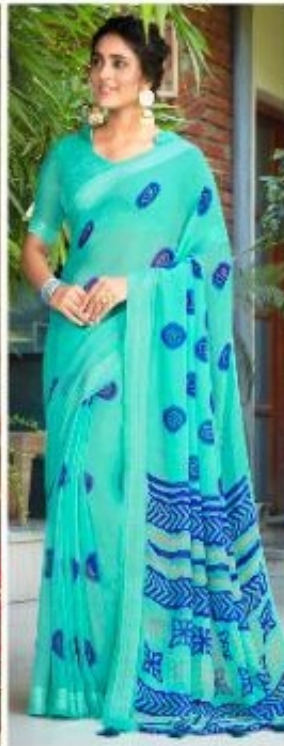
11345 - G