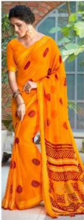
11345 - E