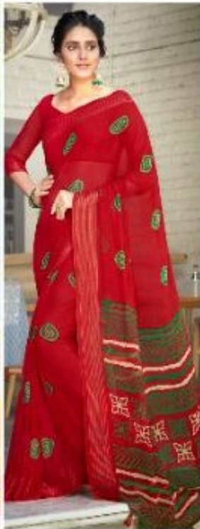
11345 - F