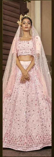
CODE / 1716