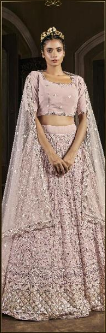
CODE / 1711