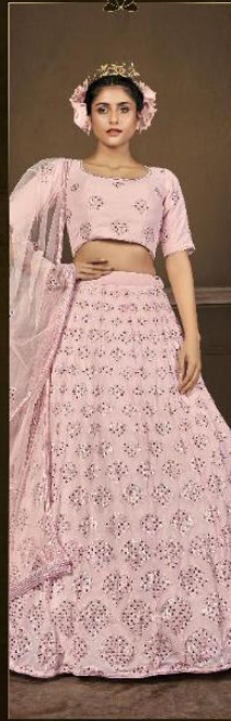
CODE / 1714