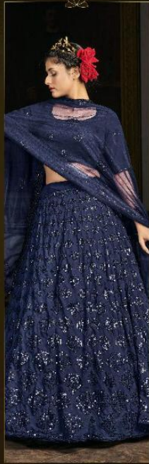
CODE / 1713