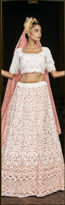
CODE / 1712