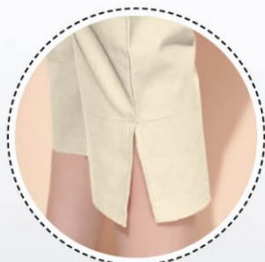
4 inch Reverse Fold Bottom Slit