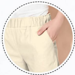
Both Side Pocket