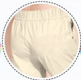
Full Waist Lastic