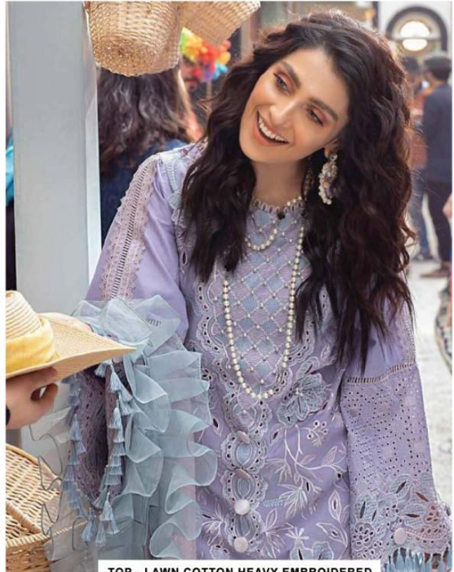
TOP - LAWN COTTON HEAVY EMBROIDERED BOTTOM - PC COTTON DUPATTA - CHIFFON DIGITAL PRINTED