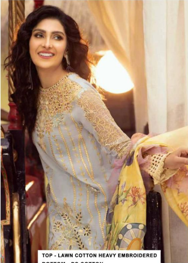
TOP - LAWN COTTON HEAVY EMBROIDERED BOTTOM - PC COTTON DUPATTA - CHIFFON DIGITAL PRINTED