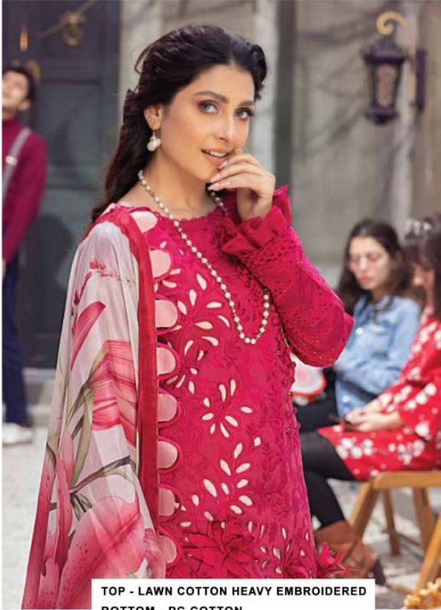
TOP - LAWN COTTON HEAVY EMBROIDERED BOTTOM - PC COTTON DUPATTA - CHIFFON DIGITAL PRINTED