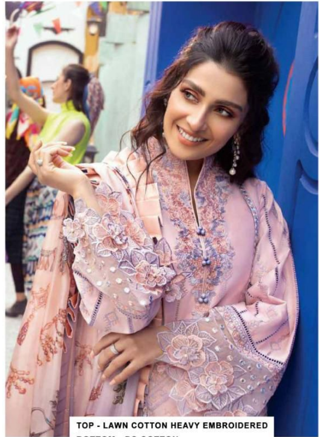
TOP - LAWN COTTON HEAVY EMBROIDERED BOTTOM - PC COTTON DUPATTA - CHIFFON DIGITAL PRINTED